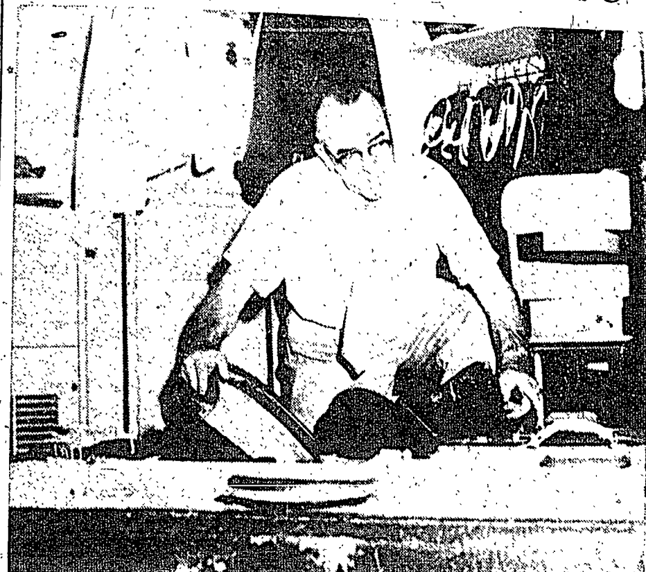
Deputy Sheriff checks music room at Maine High in search of alleged bomb. A phone call to police started school-wide search Tuesday morning. All students were excused from classes.