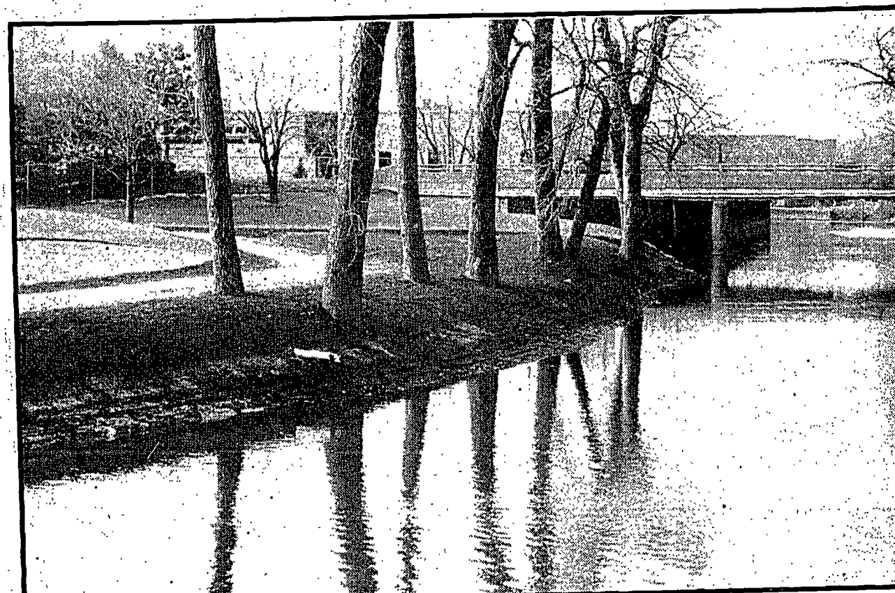
The receding, eroding riverbanks have begun to take on a new look. For the past few months during the cold off-season, workers have placed over 5,000 'a-jack' structures along the river bank. These 70 lb. concrete interlocking units were installed below the natural water line in the bank itself. See story on page 3.