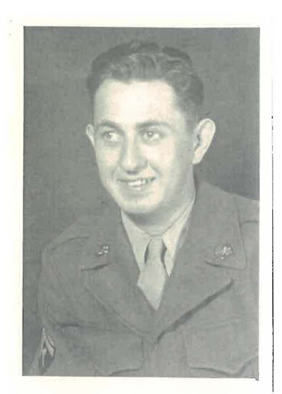
AUG. 20, 1946, AUSTRIA