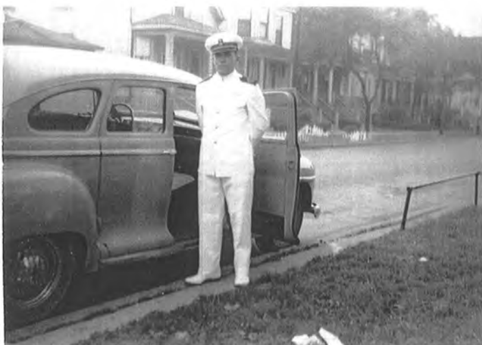
Outside home in Logan Square in Chicago, 1945