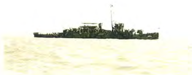
The U.S.S. Sims, side view