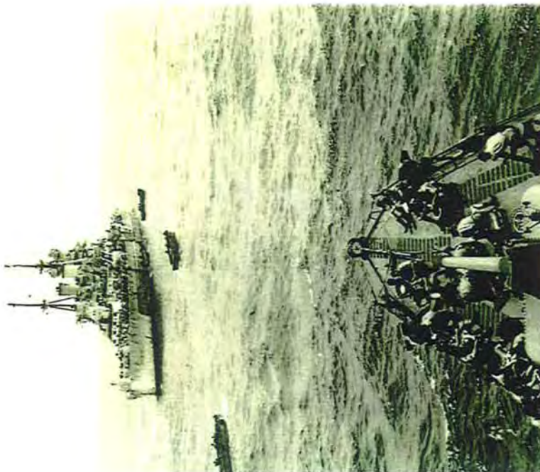
HMS King George V Battleship offloading