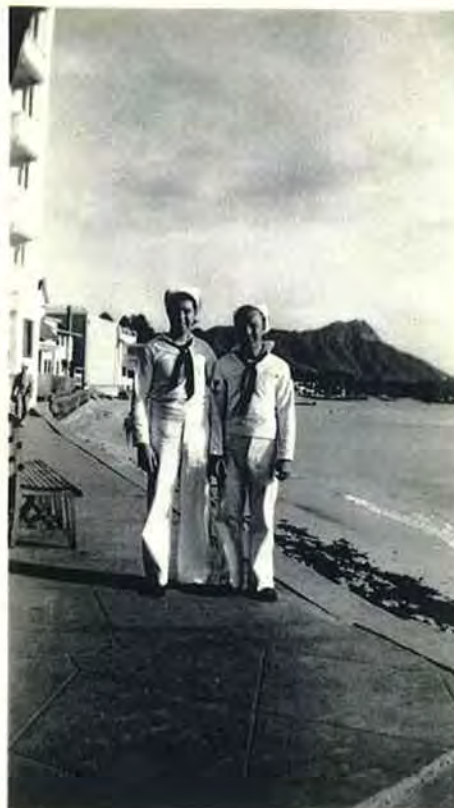
Sims crew on liberty, Waikiki Beach, December, 1945