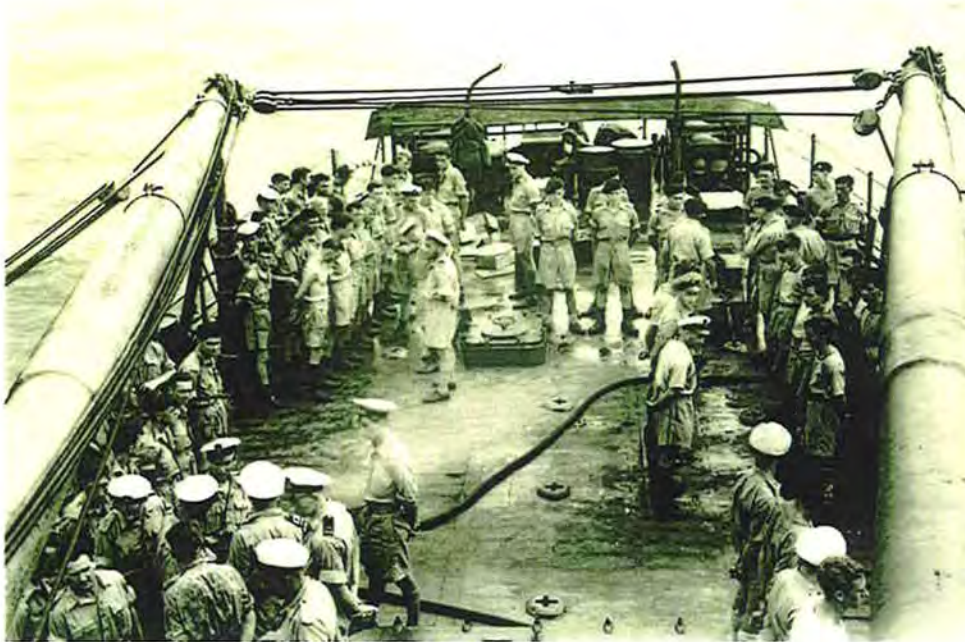
British and Australian landing party of 200 troops from the King George V taken aboard the fantail of the U.S. Sims, Yokosuka Naval Base, Tokyo Bay 20 August 1945