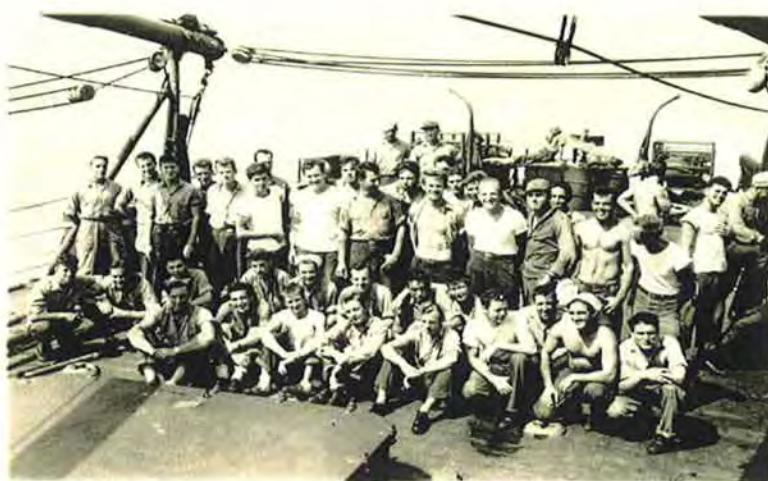
Part of the Sims crew, "a wonderful bunch of guys," on the fantail,