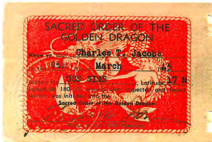
Initiation card for crossing the 180 Meridian of longitude