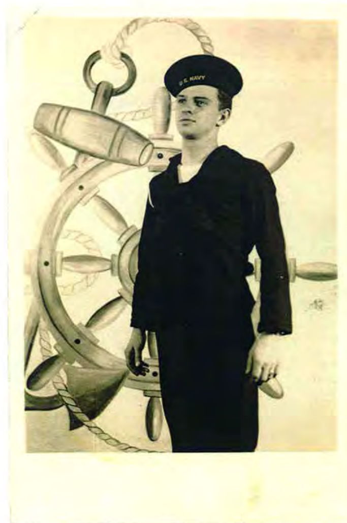
Boot Camp, Great Lakes Naval Training Station