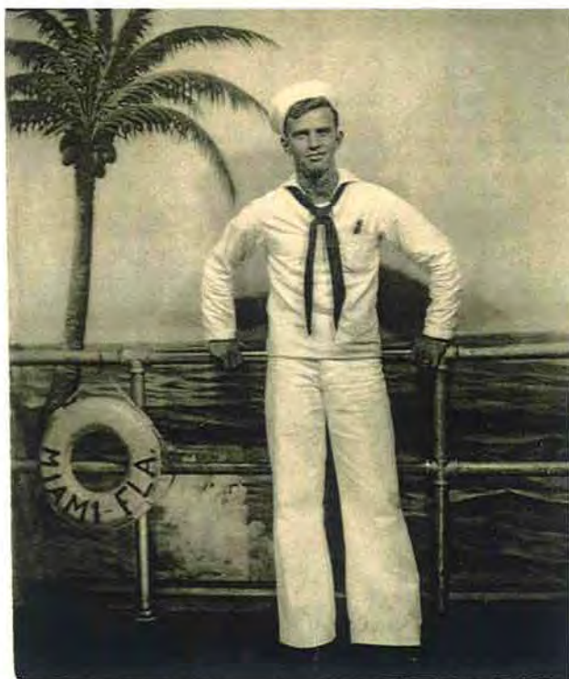
Miami, Florida, 1944