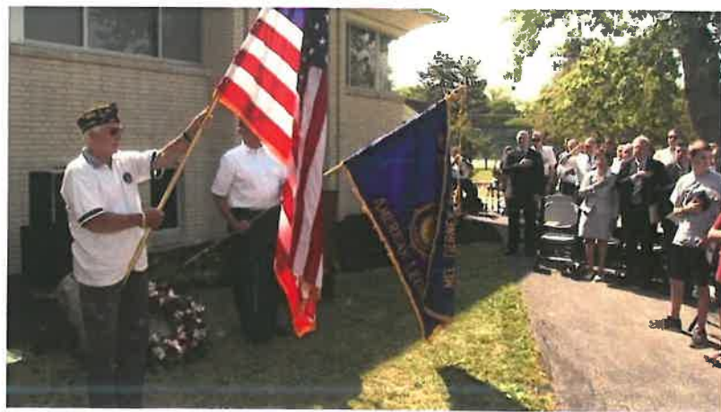
“POSTING COLORS” Park Ridge