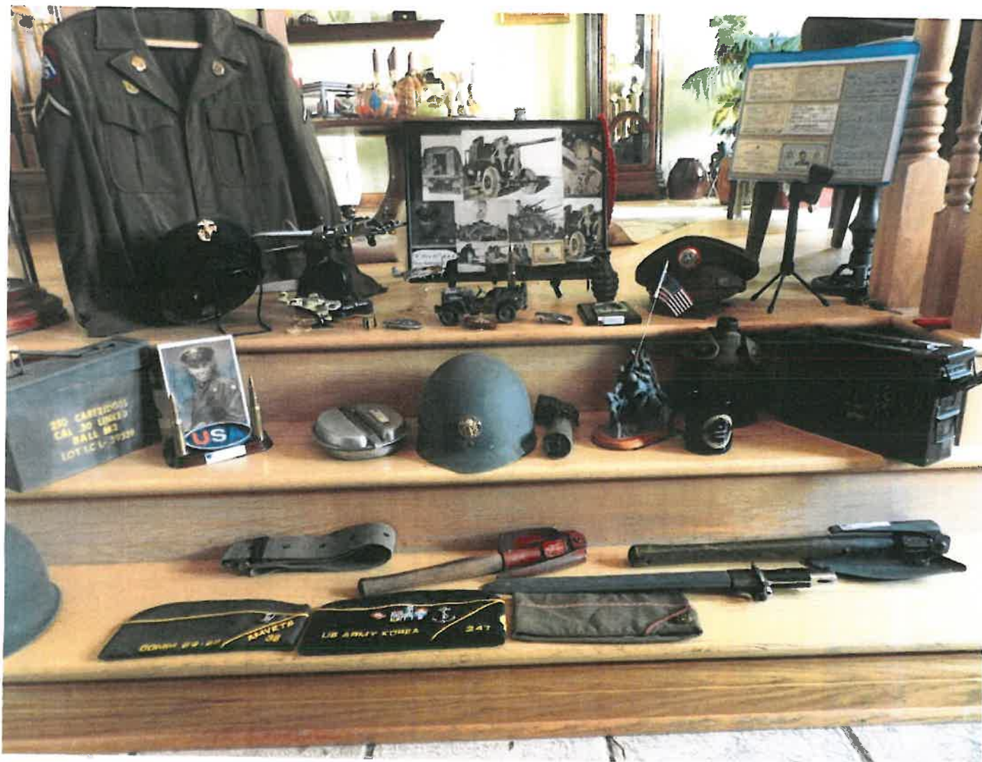
The above photograph depicts display of military memorabilia in Gary's home. He often mounts exhibits in area libraries and at community events.