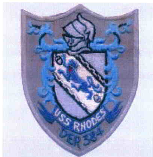
Ship's patches