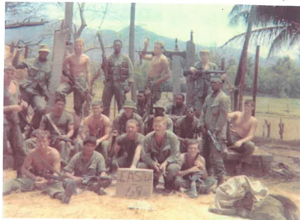
Easter 1969 far from home