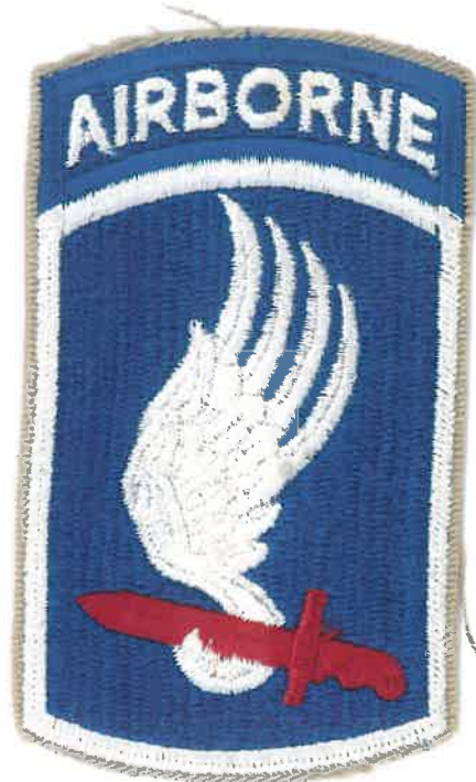
173rd Airborne Patch