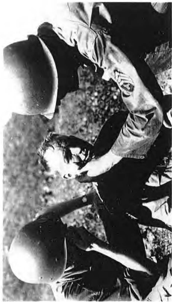
Medics caring for wounded in Burma