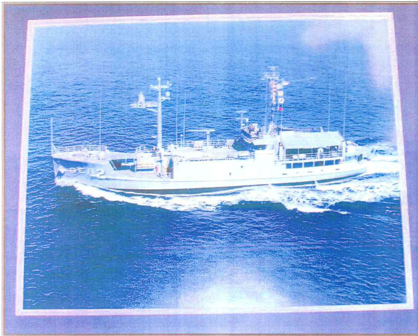
Close-up digital photograph of Mr. Rogala's framed picture of the USS Pueblo.