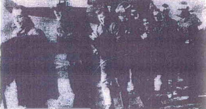
First Picture of Freed Pueblo Crew In first released photo, crew members of U.S.S. Pueblo, freed by North Koreans, are escorted by military policemen upon their arrival at army's 121st evacuation hospital at Acon City, 10 miles west of Seoul, Korea.

The crew was taken to a prison camp where they were held for 11 months.